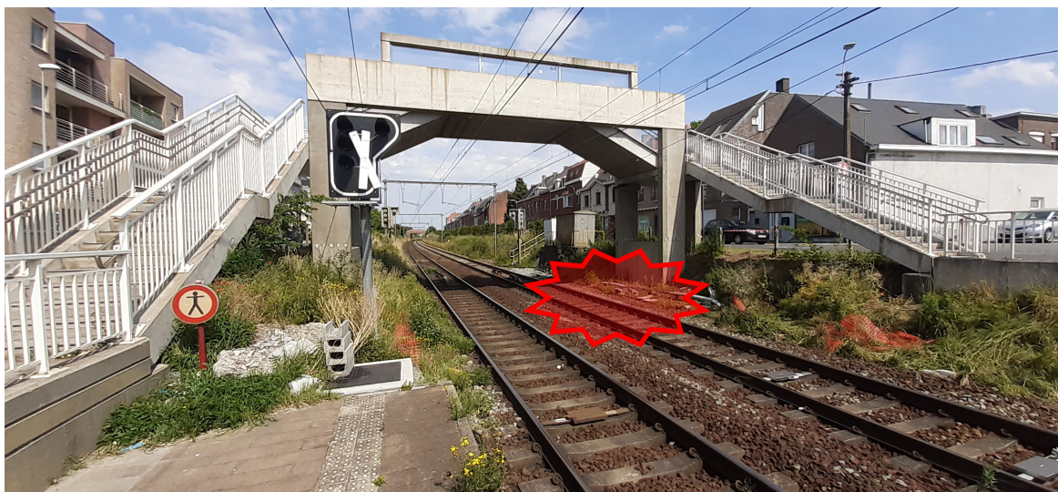
Location of the accident

The investigation is ongoing to determine the contributing, organisational and systemic factors that led to the accident.