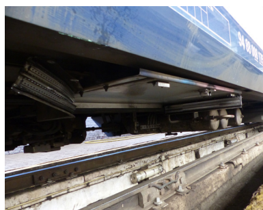
Situation on the day of the accident