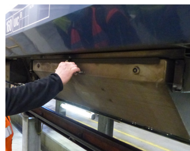
Opens like a drawer