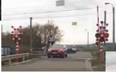
Screenshots as seen on RTL from an anonymous source